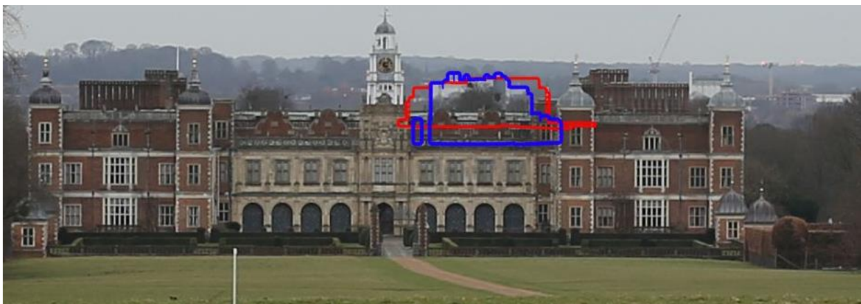
Figure 4. Magnified view of Hatfield House from the Southern Approach, with the existing massing of the site shown in Blue and Proposals shown in red.

1.9 This view takes in the open lawn located either side of the southern approach within the Park, which reflects the historic entrance way towards the main house. The quality of the view is primarily open, with a tree line framing the main house, seen centrally terminating views north along a gravelled lane. The viewpoint is positioned on a slight incline so that the wider built extent of Welwyn Garden City can be seen above the parapet line of the house in the distance. These views disappear as the house is approached and the land falls gently down. The current view includes the buildings within the Site as well as the Shredded Wheat buildings seen to the right, as well as the town centre of Welwyn Garden City. As such the existing buildings within the site are just about perceptible, seen above the parapet of Hatfield House within the wider context of Welwyn Garden City, perceived at a distance and partially obscured by the tree line beyond the house. For the purposes of clarity an expanded view has been included at Figure 4, but it should be noted that as the house is approached views of the site disappear due to the fall in the land, Figure 3 is therefore representative of the visual impact of the proposals and the assessment should be understood in this context.