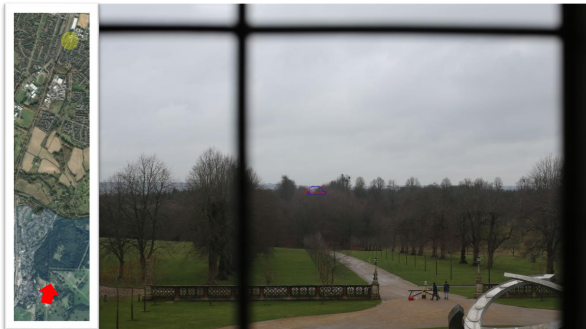
Figure 2. View from the first floor towards the Site. The site as existing is indicated by the blue line and the site as proposed is shown in red. Inset: location of the viewpoint indicated by the red arrow and the Site highlighted by the yellow transparency.