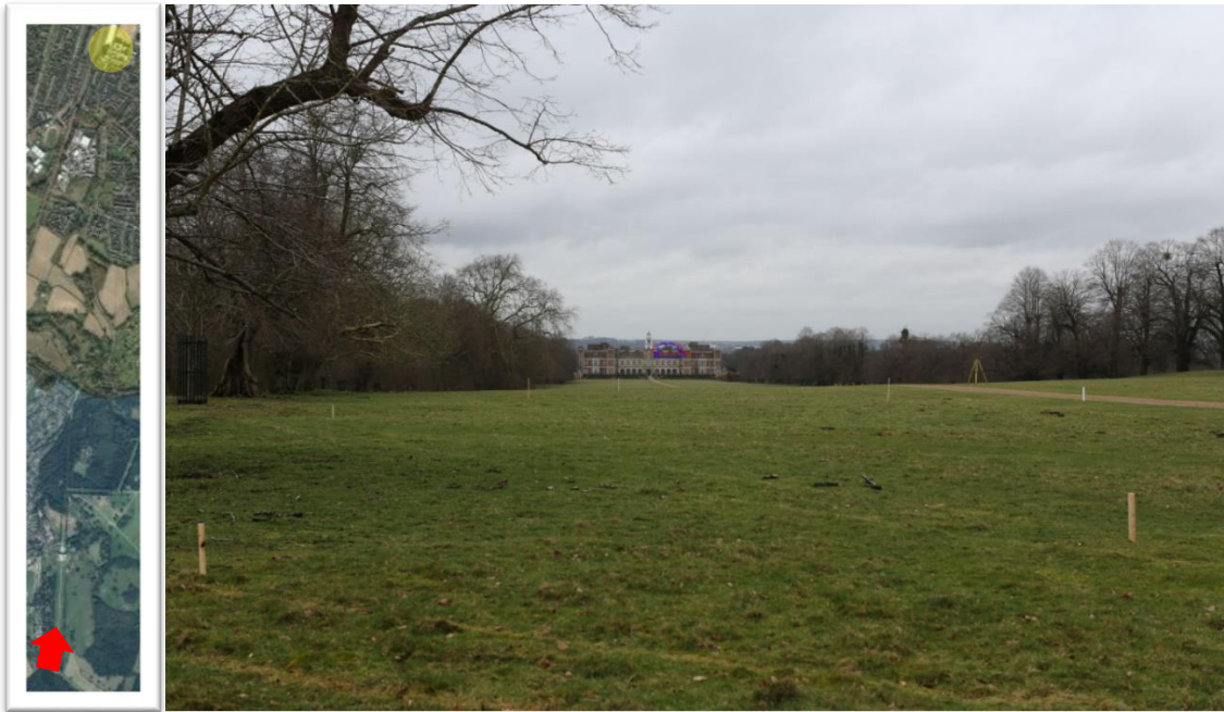
Figure 3. View from the southern approach within Hatfield House Park and Garden, looking towards the site over the house from a slight incline. The blue line indicates the existing building while the red line shows the proposed. Inset: viewpoint indicated by the red arrow while the site is highlighted in yellow.