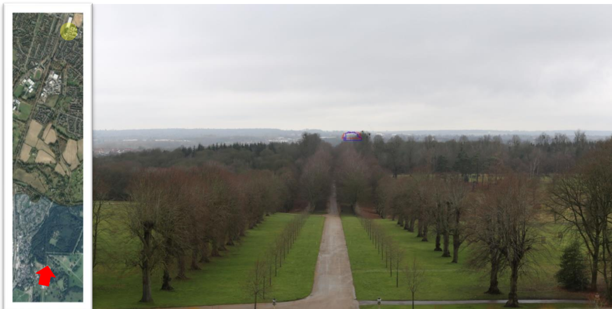
Figure 1. View from Hatfield House Roof, Existing massing within the site shown in blue, proposed shown in red. Inset: Position of view point in relation to the site, indicated by the red arrow and yellow transparency respectively.