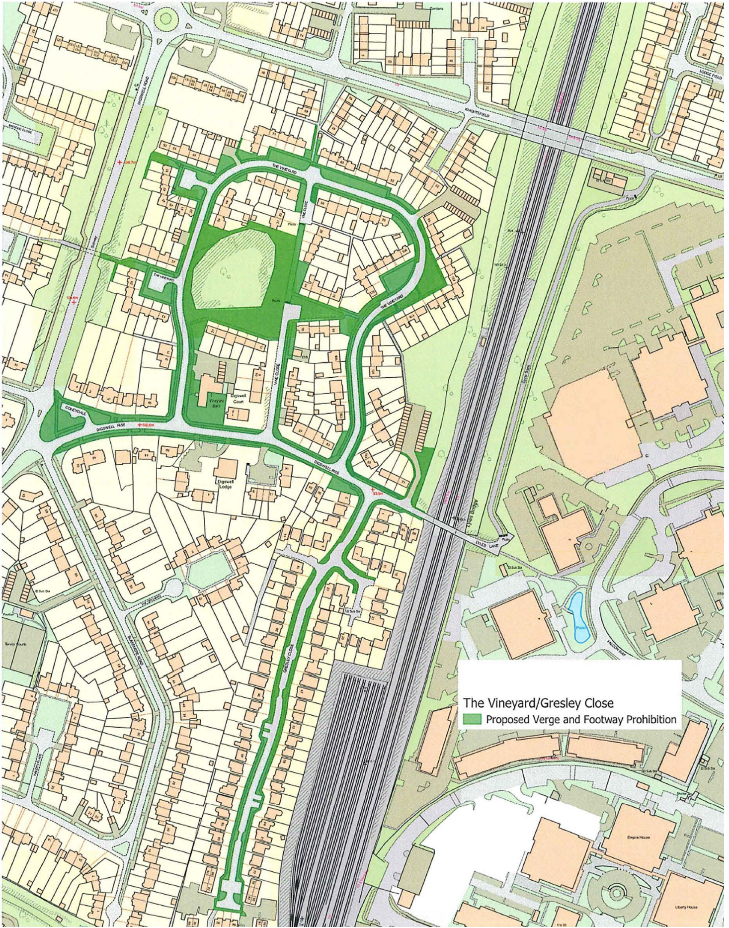
The Vineyard/Gresley Close Proposed Verge and Footway Prohibition